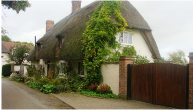
Picture 9. Thatched properties at Snow End represent an appropriate boundary to the CA along the road to Brent Pelham.