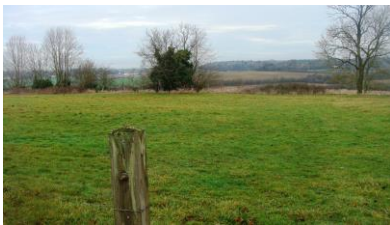
Picture 16. Land to south of Anstey Bury barn and west of Coltsfoot Cottage proposed by the PC to be included in an extended CA.