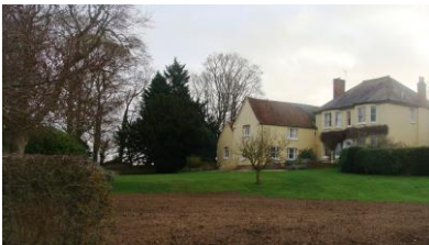
Picture 7. Bandons and any pre 1948 buildings in its curtilage are protected by listed building legislation.