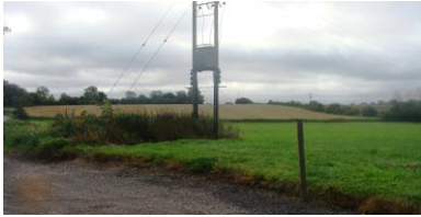
Picture 2. CA controls do not prevent new development in open countryside locations like this.

Inclusion of narrow strip principally to south side of Mill Lane. Area 1A on attached Appendix Map.