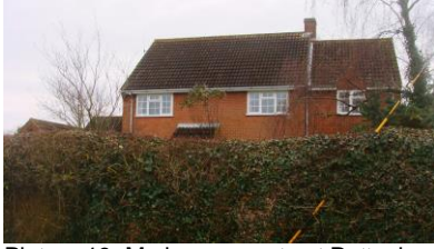
Picture 19. Modern property at Puttocks End of limited architectural or historic interest.

considered these areas are essentially two small groups of buildings in the open countryside, some being protected by listed building legislation. The surrounding 'private land' as described by the PC and proposed for inclusion, is generally considered to be more part of the open countryside the inclusion of which within a CA would not be appropriate. The two small groupings are linked by strips of countryside proposed by the PC as countryside Margins (Snow End to Puttocks End is about 1.75km). A combination of the limited impact by CA legislation, general protection already afforded by the DP and distance from the main village has formulated Officer view that this extension would not be appropriate.