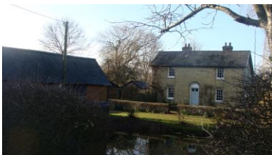
Picture 18. Pleasant complex of farmhouse and converted agricultural buildings at Puttocks End.

are also some trees of quality. Also ponds.