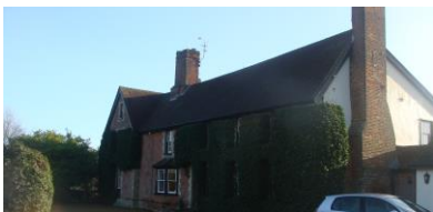
Picture 13. Anstey Bury one of three separately buildings protected by listed building legislation.

Further extension proposed by PC in easterly direction extending along road to Brent Pelham as far as Puttocks End. Areas 3A and 3B on attached Appendix Map.