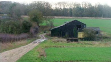
Picture 8. Agricultural land and poor quality modern agricultural barn of no architectural or historic value is clearly part of the open countryside. An application for change of use to residential was refused in 2017.

devoid of vegetation and in the view of the fieldworker forms part of the open countryside (Picture 5).