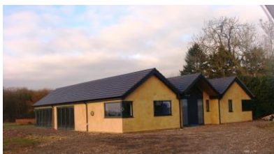
Picture 4. A modern property at Pains End very recently completed of limited architectural and no historical interest.

Include in CA as a 'Conservation Margin'. The PC considers such CM's will protect the countryside beyond.