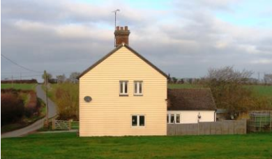
Picture 6. Unlisted property dating from late 19th century whose location appears isolated in the open countryside.