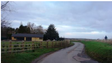
Picture 3. The area is part of open countryside including land on the left of the picture which the PC seeks to reintroduce.

Retain Pains End (Paynes End) within the CA and extend the CA to include Bandons and other properties nearby. Pains End and Bandons area to be linked by CM. Areas 2 and 2 A on attached Appendix Map.