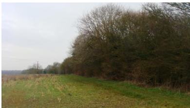
Picture 12. Area consisting of woodland in association with nearby listed properties Welspen Thatch and Dove Cottage is, on reflection, considered to be appropriately retained within the CA. Field to left of picture is open countryside beyond the CA.