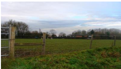
Picture 11. Open area of horse grazing no longer proposed to be within the CA.