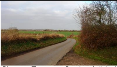
Picture 5. The area to Bandons is linked by road appearing as open countryside.