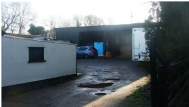
Picture 10. Some of the less attractive buildings at Essex Cottage Farm, now proposed for exclusion from the CA.