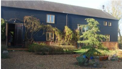
Pictures 14 and 15. Grouping of converted barns to east of Coltsfoot Farm of architectural and historic worth. These have been converted.