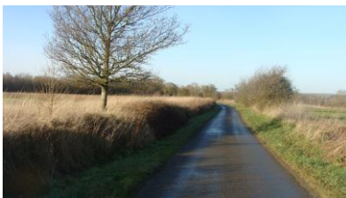
Picture 17. The road link between Anstey Bury and Puttocks End proposed by the PC as a Countryside Margin is partly hedgerow, partly open with intermittent trees.